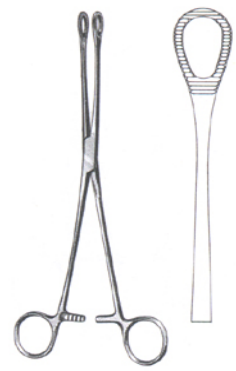
KB14-210 / KB14-212