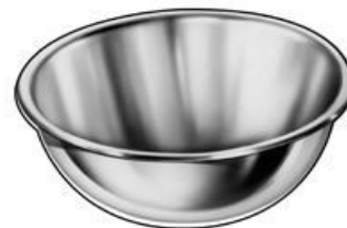
KB98-160 / KB98-320 / KB98-480

KB98-520 Sponge Bowl, 16oz (4 1/4" diameter x 2 1/4" deep)