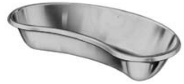
KB98-080 / KB98-100

KB98-200 2oz Graduated Medicine Cup (2" dia. x 1 7/8" deep)