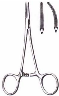
KB11-100 / KB11-101