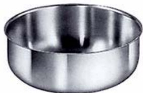
KB98-520 / KB98-750 / KB98-106

KB98-100 K-Basin, 26oz (9" length, 5" width)