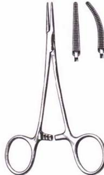
KB11-160 / KB11-161